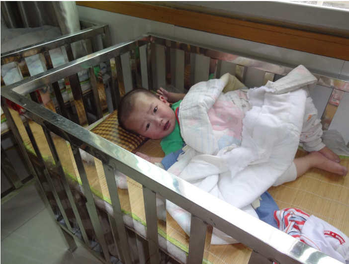
This sweetie is one of the 'heart babies' who will go to Beijing for surgery.