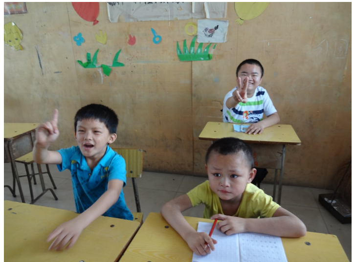
A visit to the deaf classroom where we met YLL (yellow shirt) and YZT (older, back row in striped shirt). YZT also has some cognitive impairment and can't remember new things and so the principal of the school isn't sure that he can be trained to be independent.