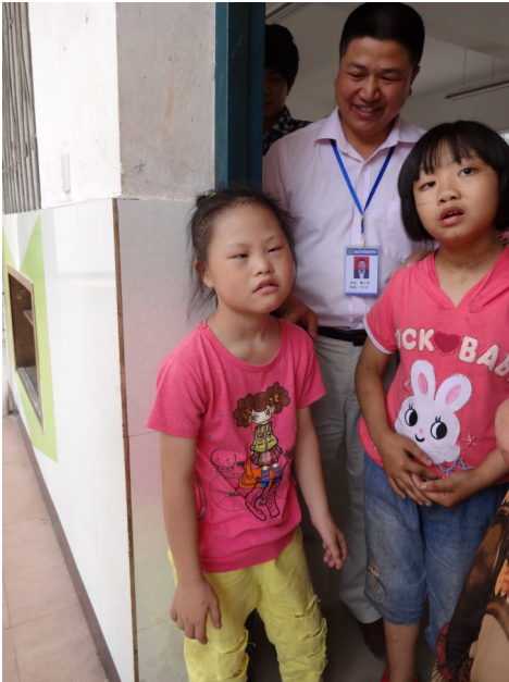
We first met adorable YFX (pink shirt, yellow pants), as well as the principal of the school.

A visit to the Special Education school where Altrusa sponsors four kids to attend