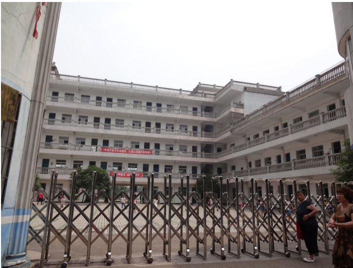
A view of the Special Education school through the gate