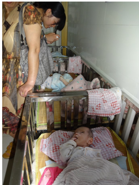
This little one has deformities of the fingers and appears to have some form of mental retardation.