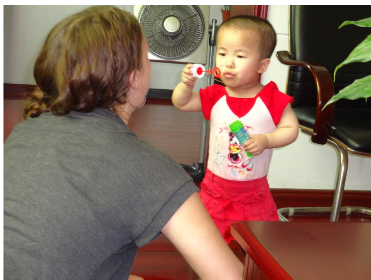
Above and below: An adorable little girl (dwarfism) having fun blowing bubbles with Megan (Peggy's daughter)