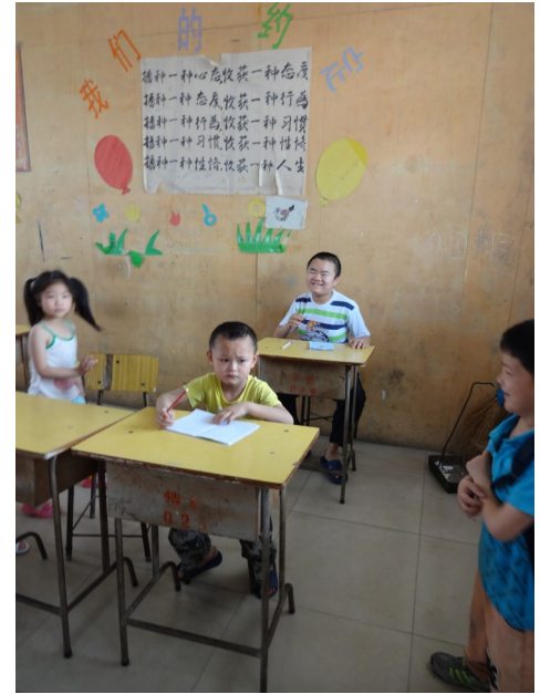
YLL and YZT in the deaf classroom