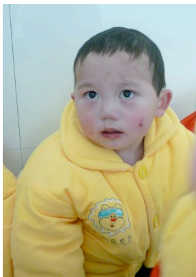
A child suffering from heart disease