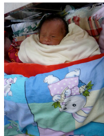
A premature baby