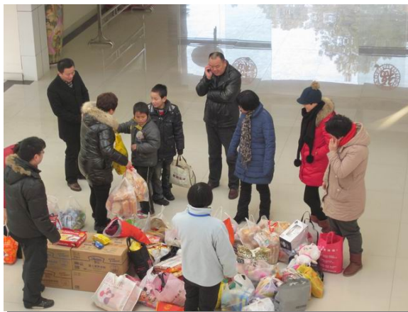
Gathering Spring Festival donations for the children.