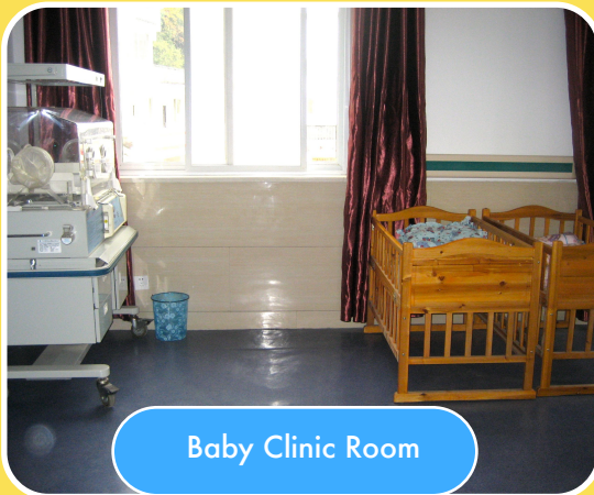
Baby Clinic Room

They are just finishing the construction of a new building.