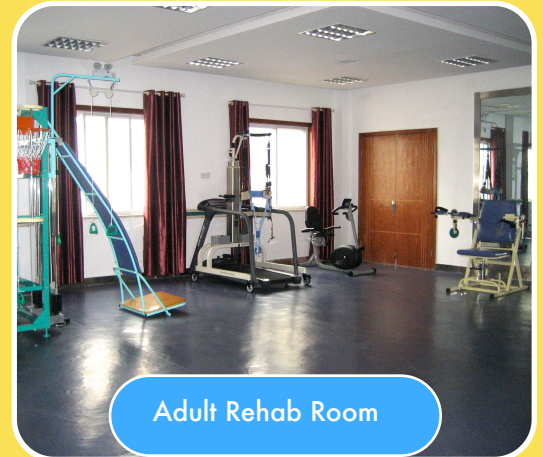
Adult Rehab Room

It houses the children and adult rehabilitation rooms, a baby clinic and a medication room. Dir. Li requested money to pay for the heater/air conditioner in the children's rehab room (see photo above). It has been installed but they have not paid for it yet.