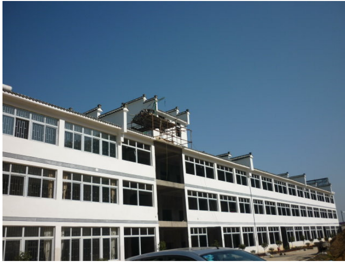
children's department on the left