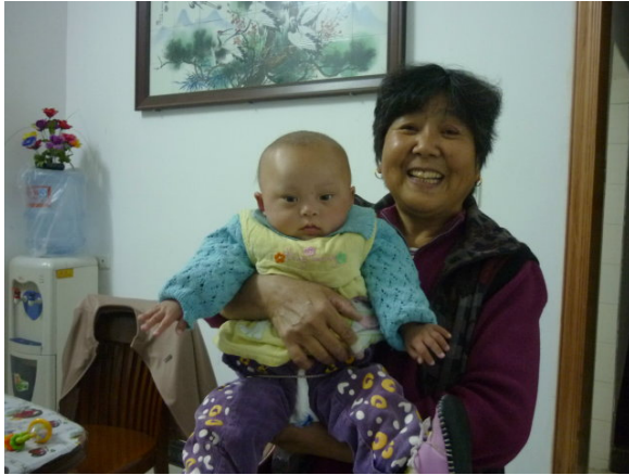
This six month old has some developmental delays so is benefiting from the close attention of a loving foster mom.