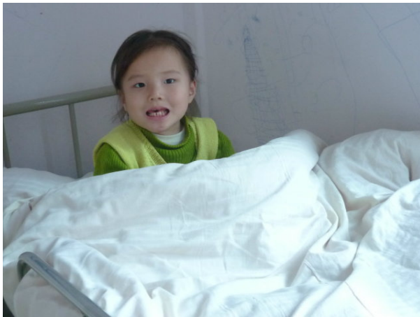
Another girl (four years old) in the hospital for surgery related to her cerebral palsy.