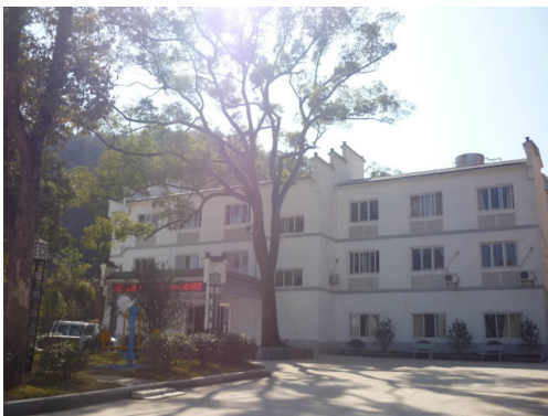
old people's building