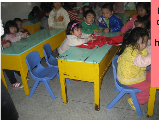
JWH with pink hairband