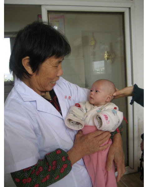
Premature baby abandoned 6 weeks ago