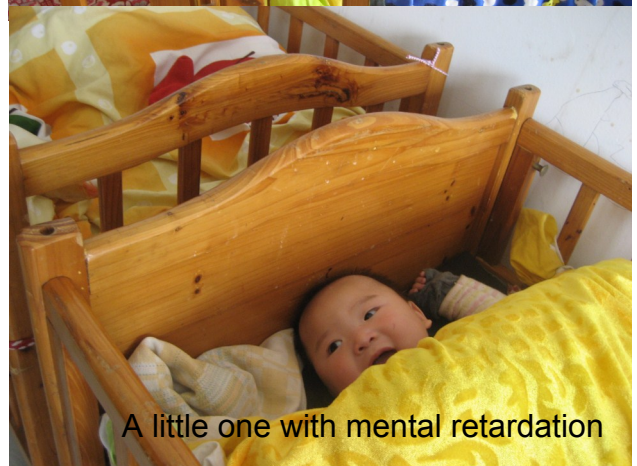
A little one with mental retardation