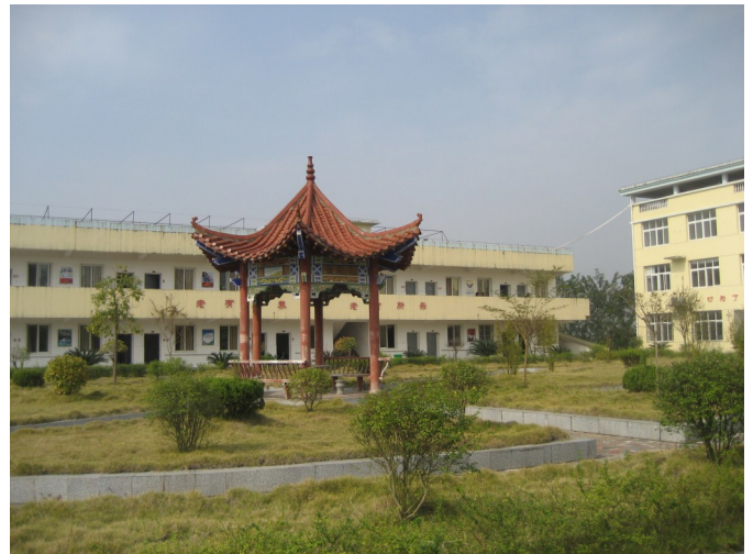
Building for elderly & disabled adults