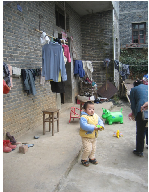
JZC playing at front of home

Visiting foster home: Foster child JZY in light beige coat is a girl born Sept2010 with the special need of "malnutrition". Her skull has a bit of an odd shape but they say she's been tested for hydrocephalus and doesn't have it. JZC in a yellow coat with blue sleeves is a boy born July 2010 with the initial special need of "developmental delay". Both of these children have improved a great deal in foster care and now have their papers in for international adoption