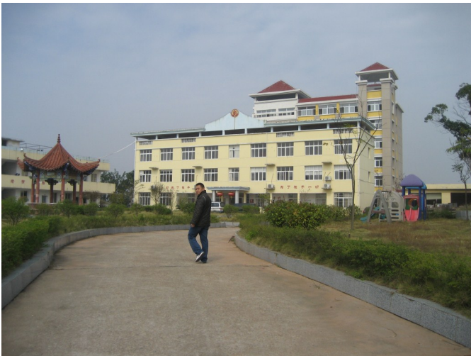
Walking toward building with baby rooms