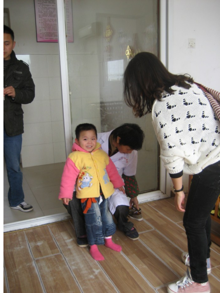
This cutie has mild cerebral palsy