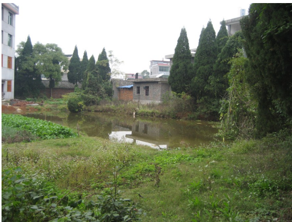
On the walk from foster mom's home to new home for her sons