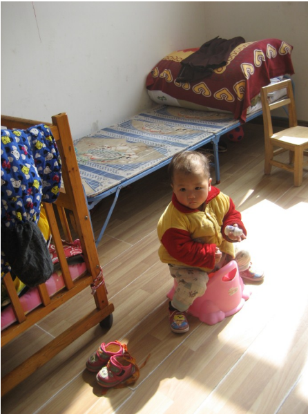
This child recently had heart surgery and papers have been sent in for adoption