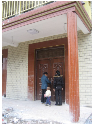
Front door of new home