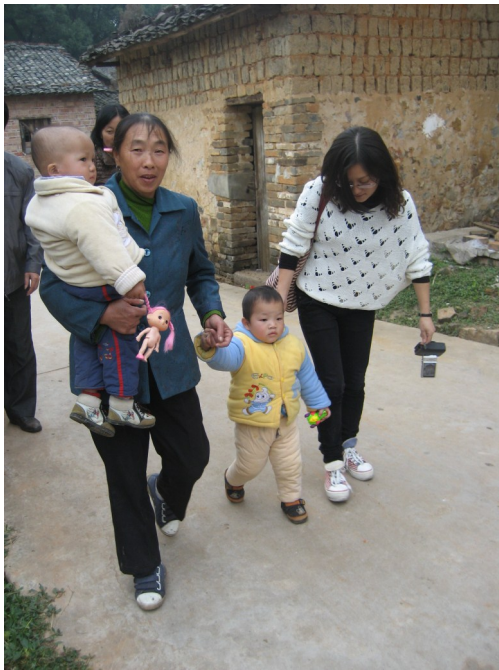
Foster mom, JZY, JZC & Ms Luo (Amity)

Visiting foster home: Foster child JZY in light beige coat is a girl born Sept2010 with the special need of "malnutrition". Her skull has a bit of an odd shape but they say she's been tested for hydrocephalus and doesn't have it. JZC in a yellow coat with blue sleeves is a boy born July 2010 with the initial special need of "developmental delay". Both of these children have improved a great deal in foster care and now have their papers in for international adoption