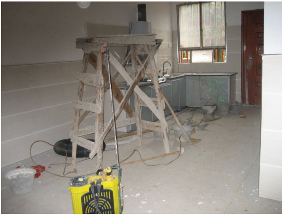
Inside view of new home being built for 2 grown sons of foster mother