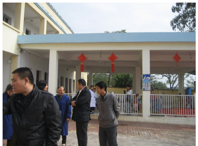
Covered play area