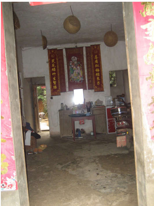
Looking inside foster mom's front door