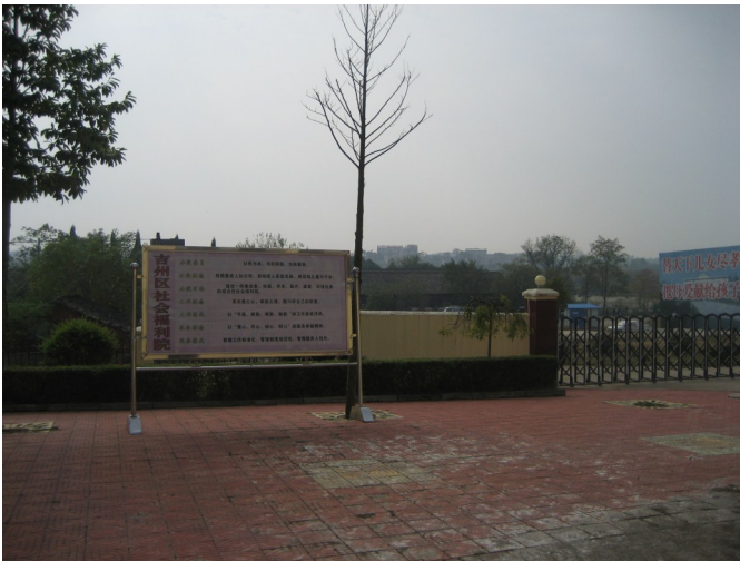
Looking out from the front of the SWI