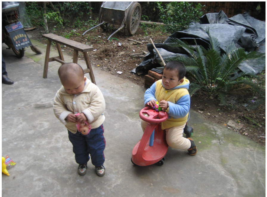
Playing in front of foster mom's home