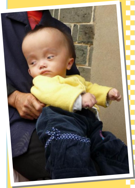
FM, an 18-month-old boy with hydrocephalus, is a foster child sponsored by Altrusa.