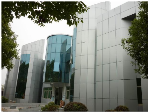
The new, advanced rehabilitation center.

In May, the Fuzhou SWI received approval from the Jiangxi Provincial Department of Civil Affairs to establish an advanced rehabilitation center for disabled children. Currently, the SWI is in the process of renovating the facility. Upon completion of the renovations, the SWI will be able to accept disabled children from other orphanages that do not have the proper rehab facilities. This is great news, as more children will now have access to and benefit from physical therapy, speech therapy, etc.