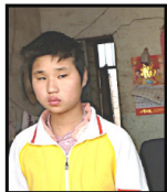
SY, girl, age 13, cerebral palsy - Shanggao

School Sponsorship = $1174 still needed (annual total is $2174)